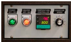
Tunnel Control Panel